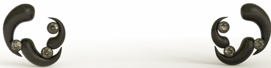
Tiny Talon Coalition Hoops in Black Gold 0.5 in. Drop, $1,700 | $3,400