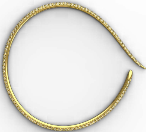
Layana With Pave 3.5 Inch Drop, $11,000 | $22,000