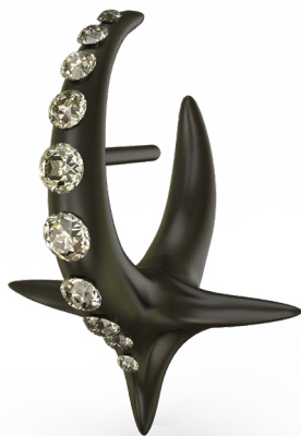
Solo Spike Hoops Black Gold with Diamonds $4,000 | $8,000