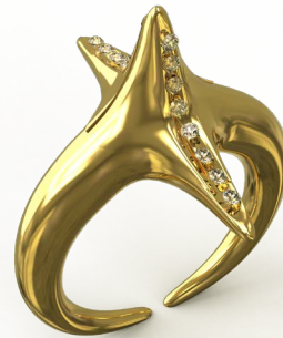
One spike Ring With YGold + Diamonds Sizes 5-8, $2,600 | $5,200