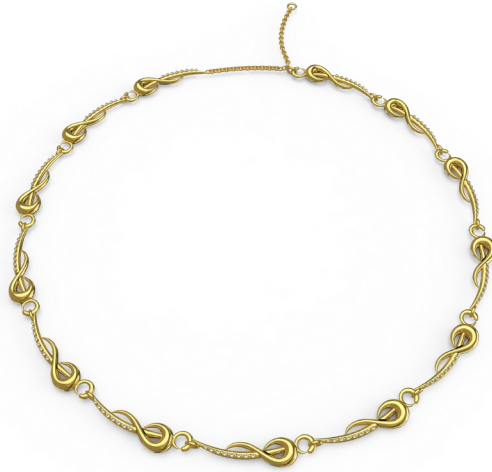
Toussaint Link Chain in Yellow Gold with Diamonds $5,500 | $11,000