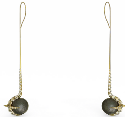
Pearl Protection Drops, Yellow Gold and Black Pearl 2.5 in Drop, $5,500 | $11,000