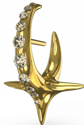
Solo Spike Hoops with Diamonds $3,250 | $6,500