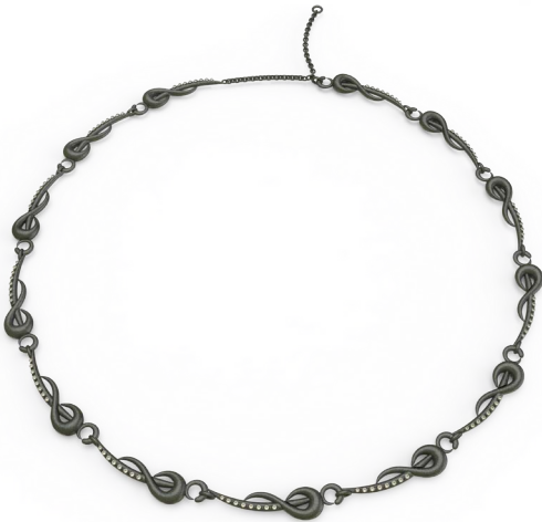
Toussaint Link Chain in Black Gold with Diamonds $6,250 | $12,500