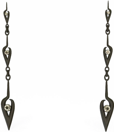
Iklwa Chain Drops w Black Gold and White Diamonds $5,350 | $10,700