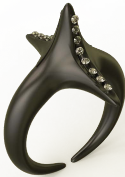
One Spike Ring Black Gold with Diamonds Sizes 5-8, $2,125 | $4,250