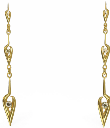
Iklwa Chain Drops w Yellow Gold and White Diamonds $4,570 | $9,500