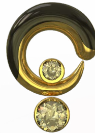
Tiny Khartoum Studs with Onyx Inlay and Diamonds $2,500 | $5,000