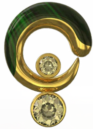
Tinh Khartoum Studs with Malachite and Diamonds $2,500 | $5,000