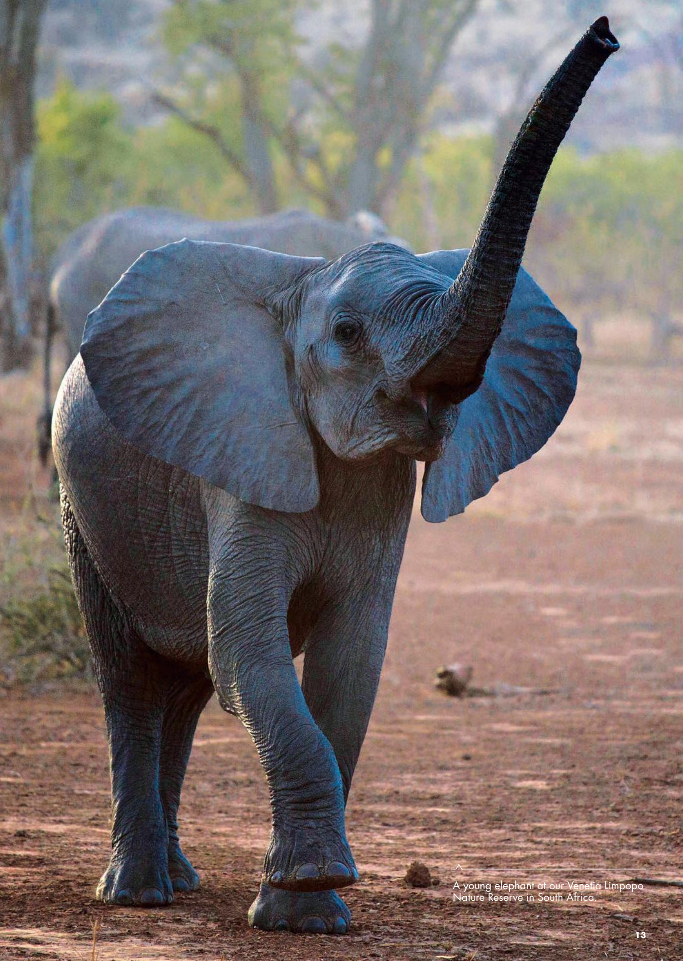
^ A young elephant at our Venetia Limpopo Nature Reserve in South Africa.