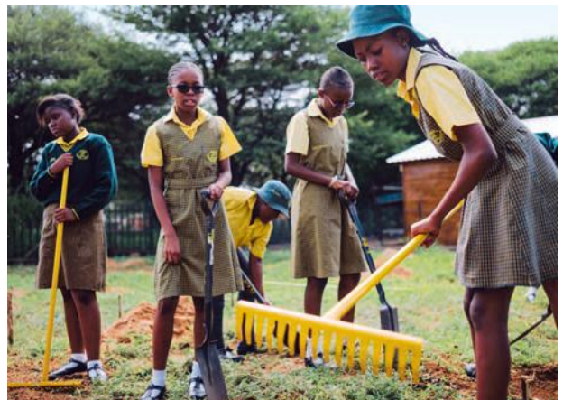
Schoolchildren take part in gardening classes at Acacia Primary School, Botswana.