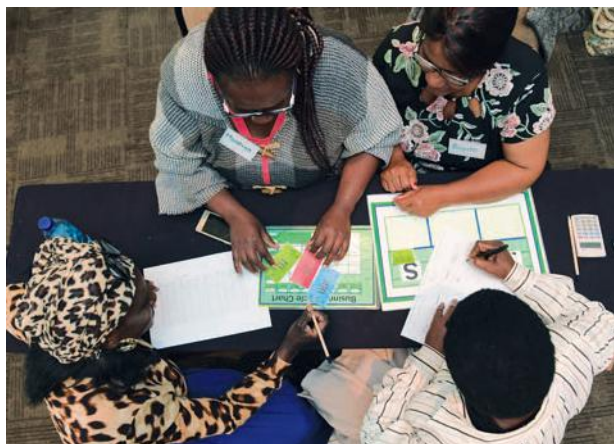
Participants at an AWOME training event in Namibia.