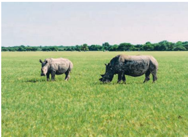
Rhinos graze at one of De Beers Group's Diamond Route sites.