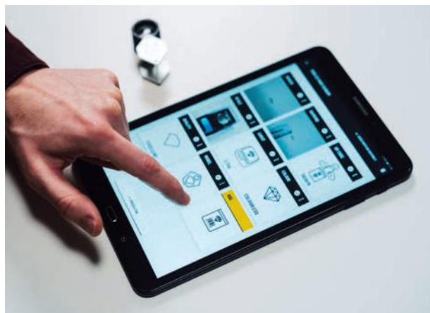
A De Beers Group employee demonstrates the GemFair™ toolkit.